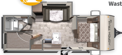
ASPEN TRAIL LE 23BH

Length: 27' 11" Weight: 5,940 lbs Sleeps: 6-8 Fresh Water: 37 gals.. Grey Water: 42 gals. Waste Water: 42 gals.