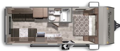
ASPEN TRAIL LE 21RD

Length: 24' 11" Weight: 4,690 lbs Sleeps: 2-4 Fresh Water: 37 gals.. Grey Water: 42 gals. Waste Water: 42 gals.