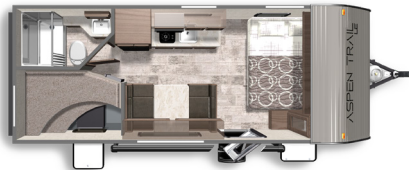
ASPEN TRAIL MINI 1950BH

Length: 21' 5" Weight: 3,577 lbs Sleeps: 4-6 Fresh Water: 27 gals.. Grey Water: 28 gals. Waste Water: 28 gals.