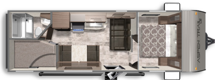
ASPEN TRAIL LE 25BH

Length: 27' 11" Weight: 5,940 lbs Sleeps: 6-8 Fresh Water: 37 gals.. Grey Water: 42 gals. Waste Water: 42 gals.