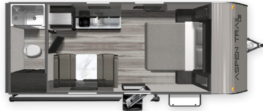
ASPEN TRAIL MINI 17RB

Length: 21' 5" Weight: 2,978 lbs Sleeps: 3-4 Fresh Water: 27 gals.. Grey Water: 28 gals. Waste Water: 28 gals.