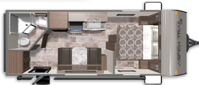
ASPEN TRAIL LE 19RB

Length: 24' 11" Weight: 4,690 lbs Sleeps: 2-4 Fresh Water: 37 gals.. Grey Water: 42 gals. Waste Water: 42 gals.