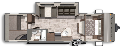
ASPEN TRAIL LE 29BH

Length: 30' 9" Weight: 6,298 lbs Sleeps: 2-4 Fresh Water: 37 gals.. Grey Water: 42 gals. Waste Water: 42 gals.