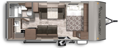
ASPEN TRAIL MINI 1860RK

Length: 21' 5" Weight: 2,964 lbs Sleeps: 2-4 Fresh Water: 27 gals.. Grey Water: 28 gals. Waste Water: 28 gals.