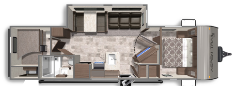
ASPEN TRAIL LE 29TB

Length: 33' 3" Weight: 6,484 lbs Sleeps: 6-8 Fresh Water: 40 gals.. Grey Water: 42 gals. Waste Water: 42 gals.