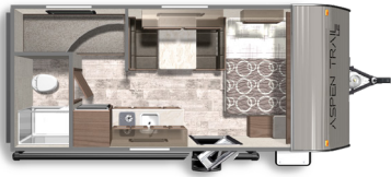
ASPEN TRAIL MINI 17BH

Length: 21' 5" Weight: 2,978 lbs Sleeps: 3-4 Fresh Water: 27 gals.. Grey Water: 28 gals. Waste Water: 28 gals.