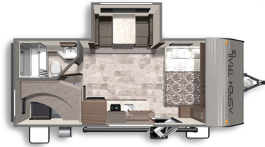
ASPEN TRAIL MINI 1980BH

Length: 23' 5" Weight: 3,676 lbs Sleeps: 6-8 Fresh Water: 27 gals.. Grey Water: 28 gals. Waste Water: 28 gals.