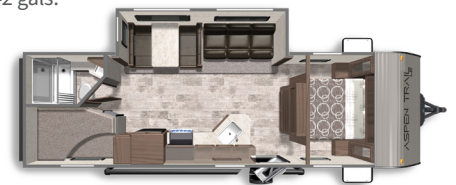
ASPEN TRAIL LE 26BH

Length: 28' 8" Weight: 4,837 lbs Sleeps: 4-6 Fresh Water: 37 gals.. Grey Water: 42 gals. Waste Water: 42 gals.